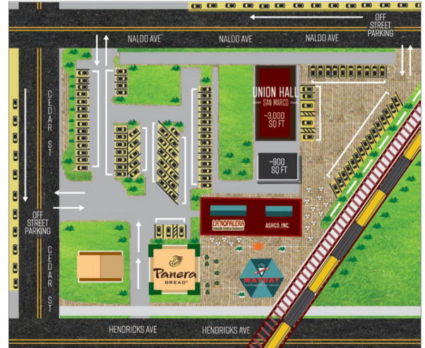
Rendering of the new San Marco Train Station/Union Hall complex being designed and developed by AshCo Inc.