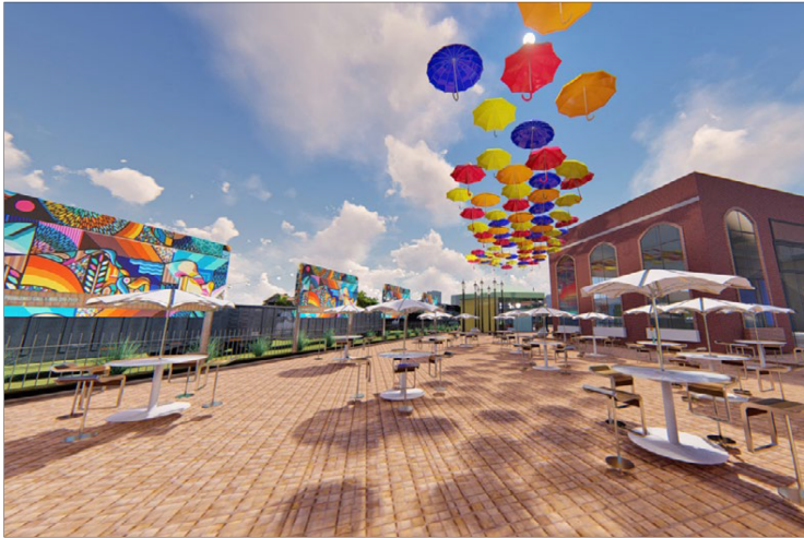
Colorful umbrellas and original artwork could make the Union Hall complex San Marco's new arts district.